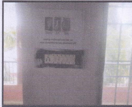
Slogans written on to save electricity in college premises.