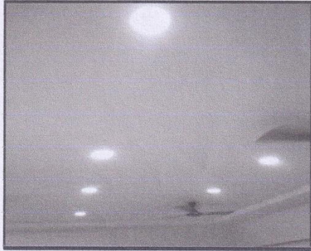
LEd bulbs used in the college.