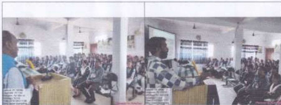
Photo of "Career Counselling" program